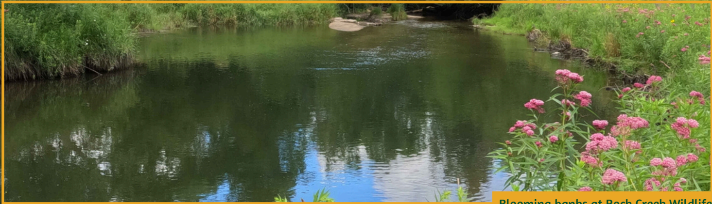
Blooming banks at Rock Creek Wildlife Area

NEWSLETTER FOR MITCHELL COUNTY CONSERVATION BOARD AND ENVIRONMENTAL EDUCATION FOUNDATION