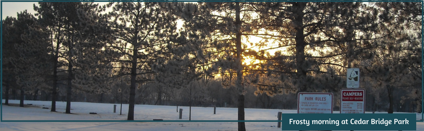
Frosty morning at Cedar Bridge Park