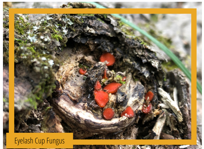
Eyelash Cup Fungus