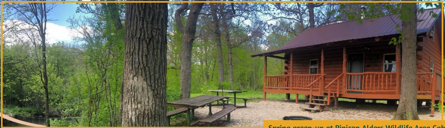
Spring green-up at Pinicon Alders Wildlife Area Cabin

Who's excited for Spring hunting season?! We are - and hope you are too after joining us at the Deer & Turkey Expo! We want to see your deer, antlers, beard, and spurs no matter how big or small! Mounts/sheds/beards/spurs can be from any year. Local lockers, taxidermists, hunting experts, and conservation professionals will be on hand to help with any of your hunting-related needs.