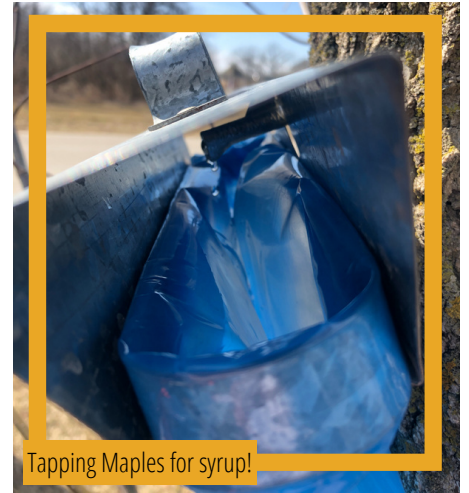
Tapping Maples for syrup!